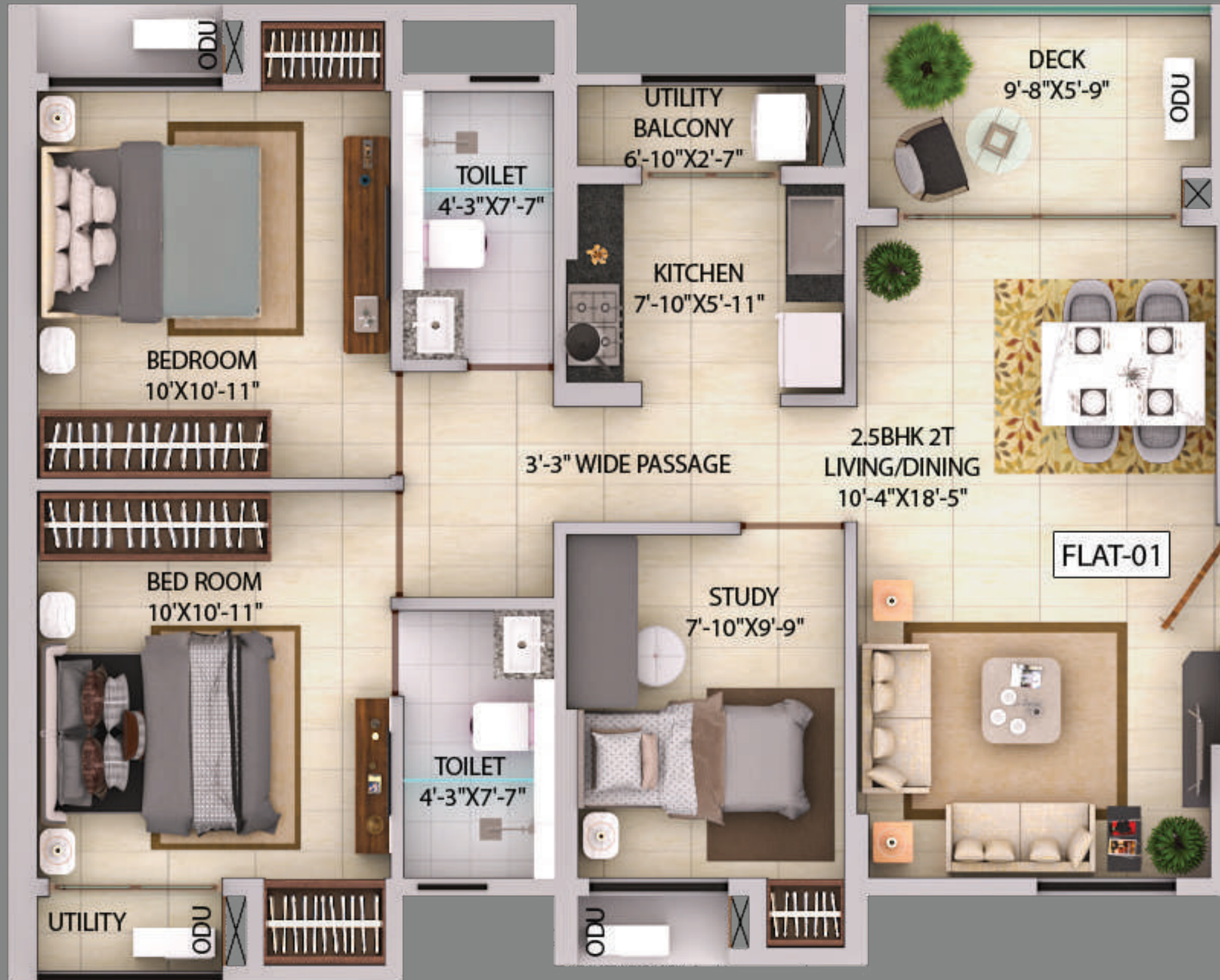
TOWER D - FLAT 1