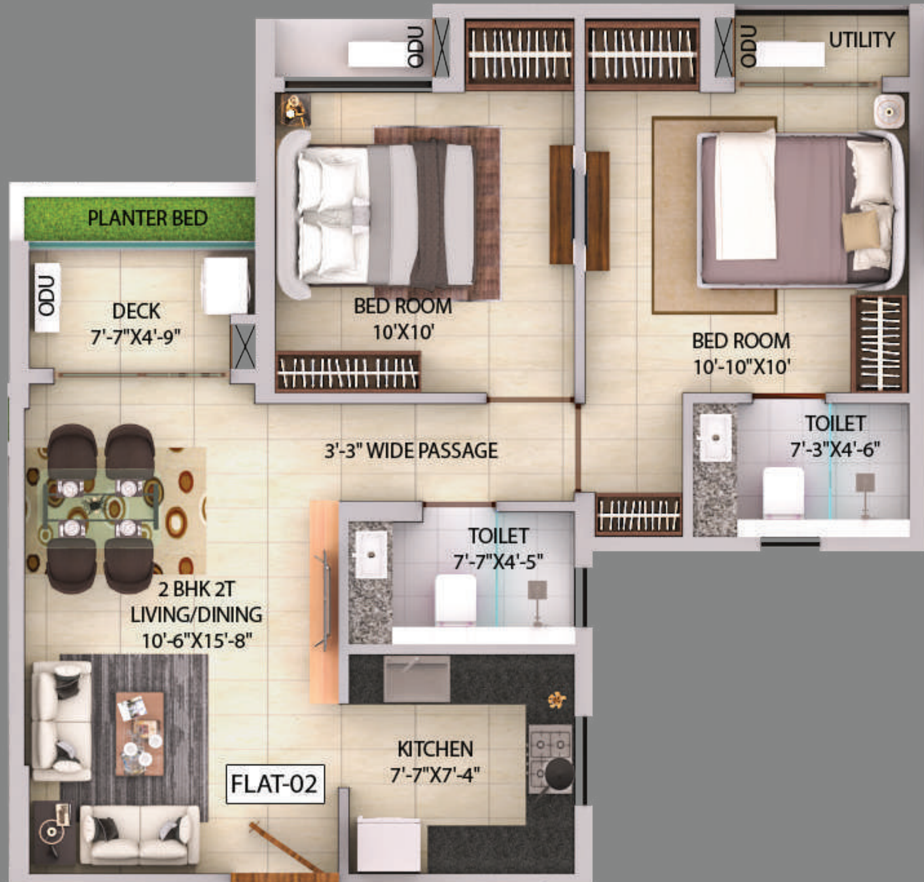
TOWER D - FLAT 2