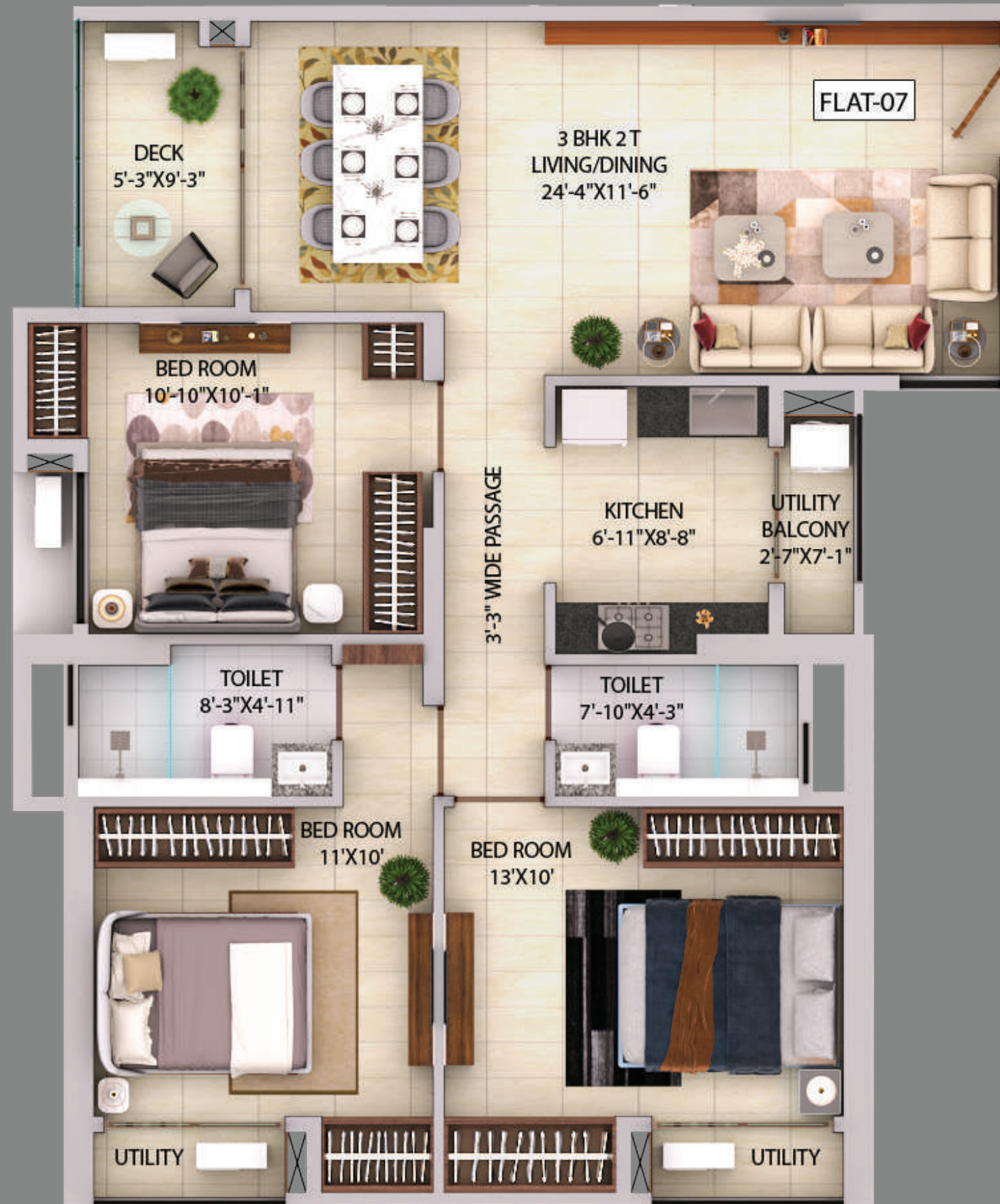
TOWER D - FLAT 7