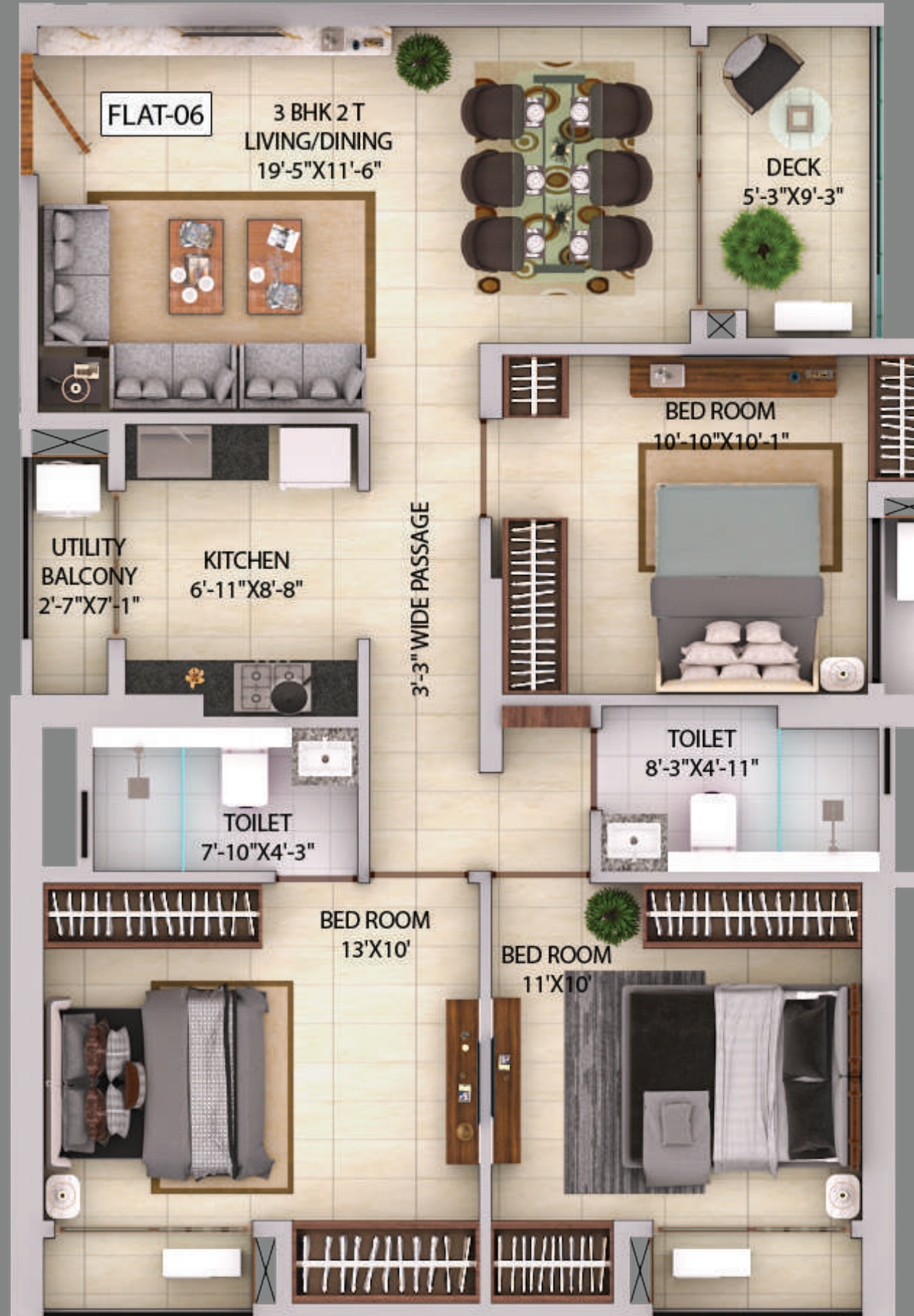
TOWER D - FLAT 6