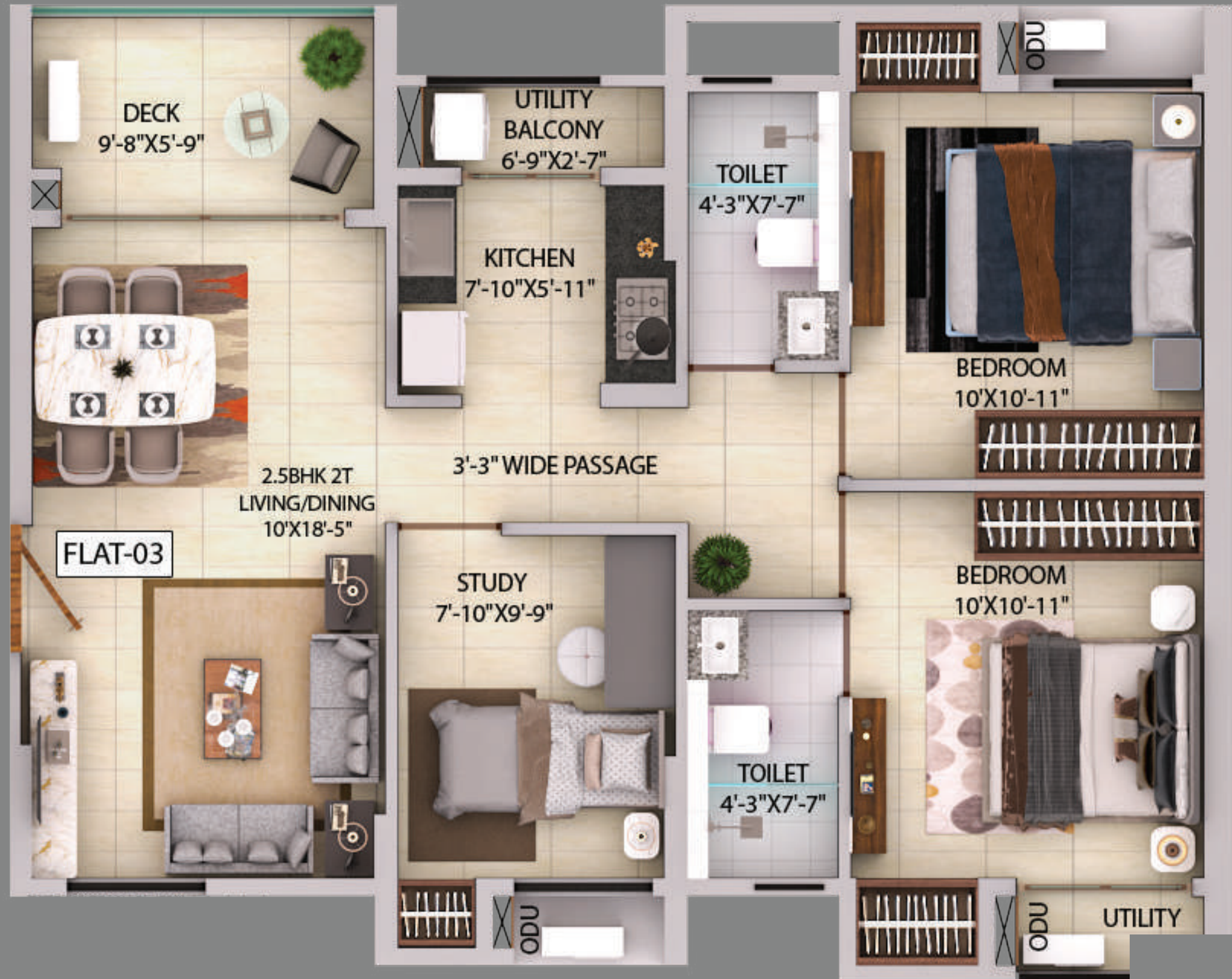
TOWER D - FLAT 3