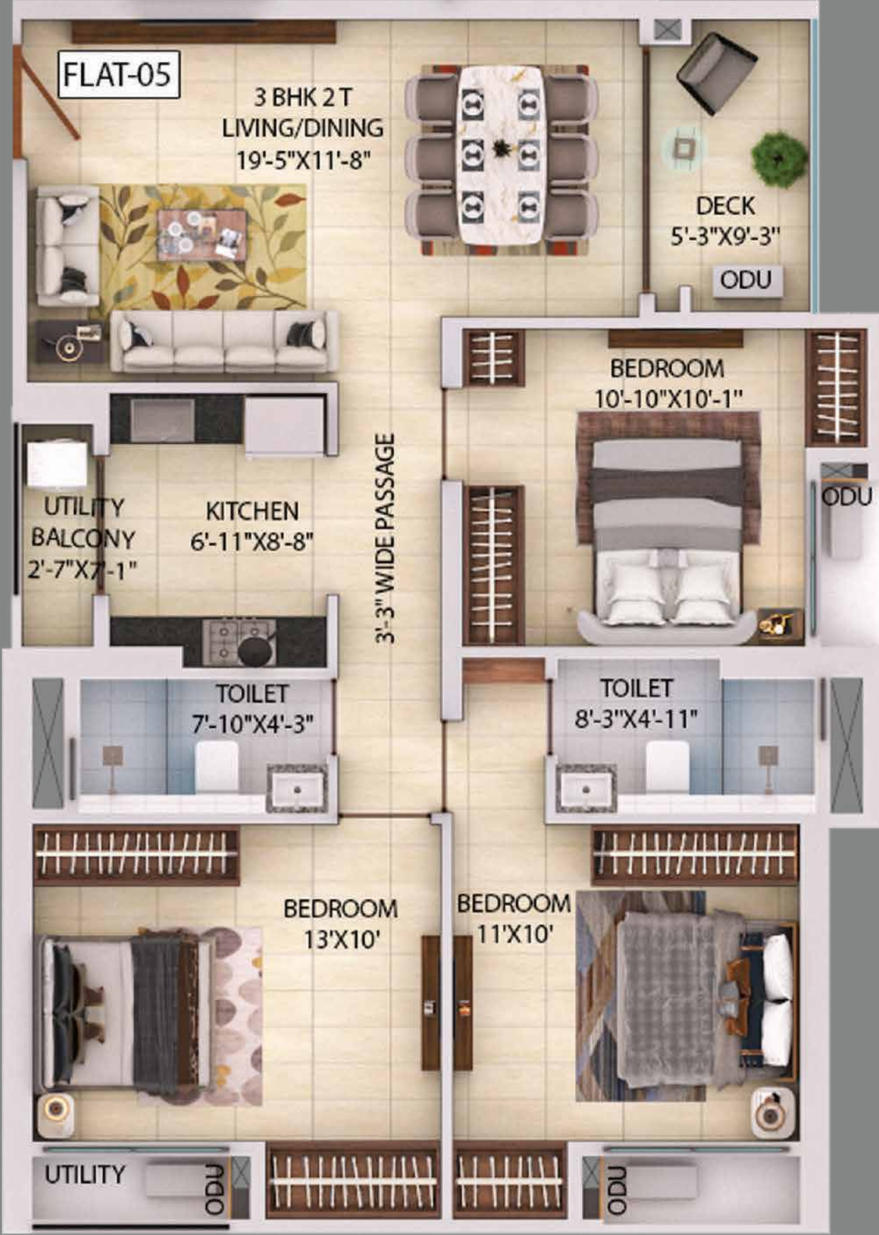
TOWER C - FLAT 5