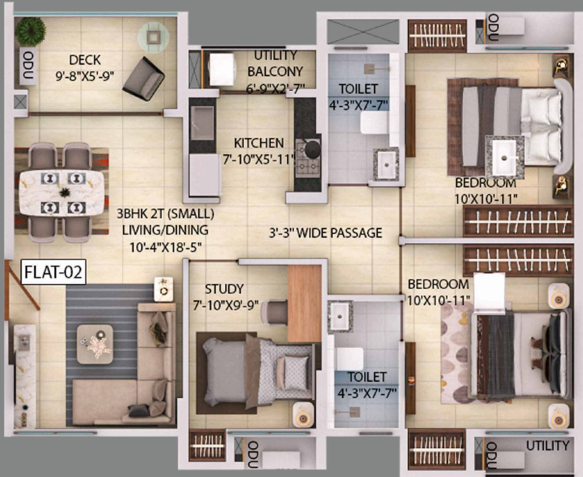
TOWER C - FLAT 2