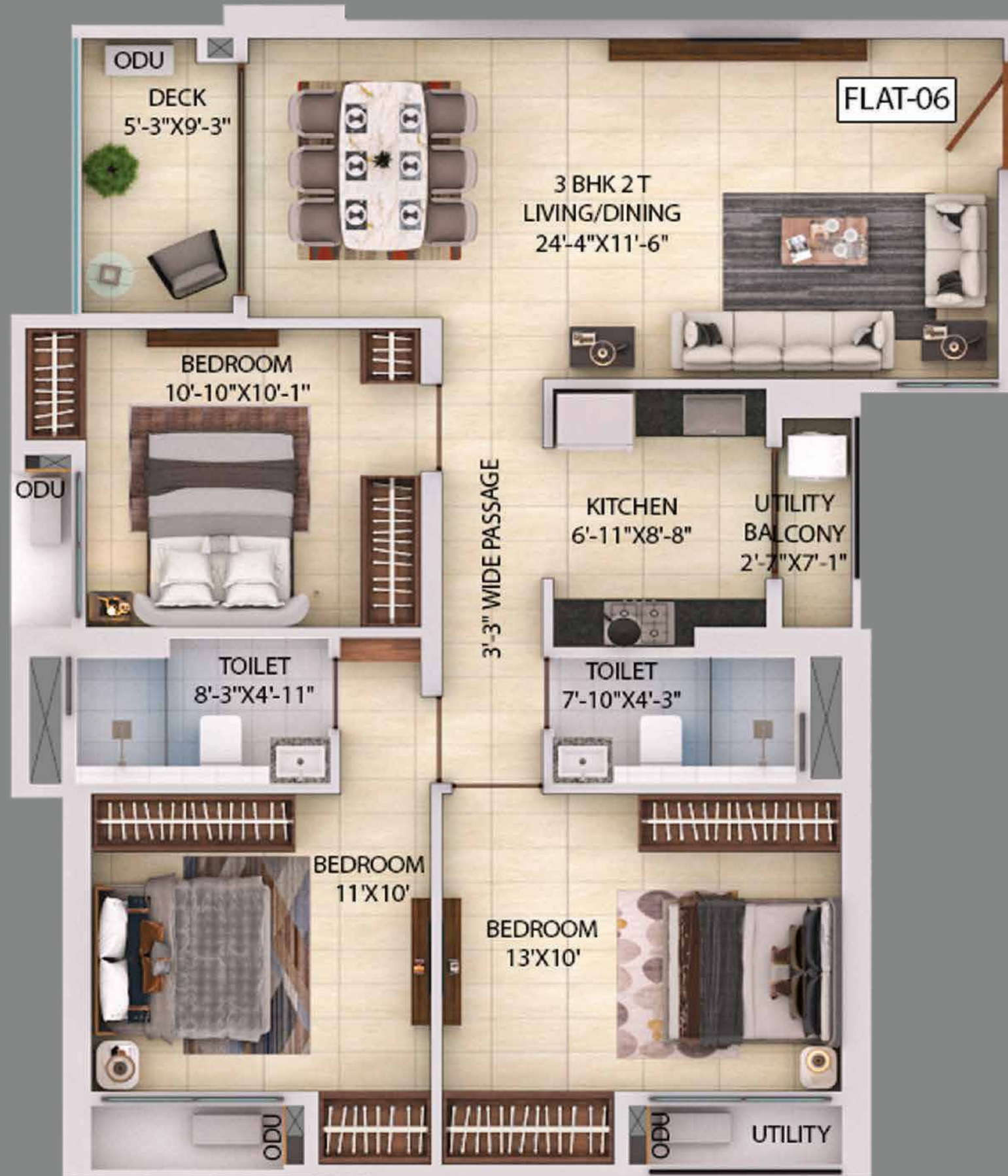
TOWER C - FLAT 6