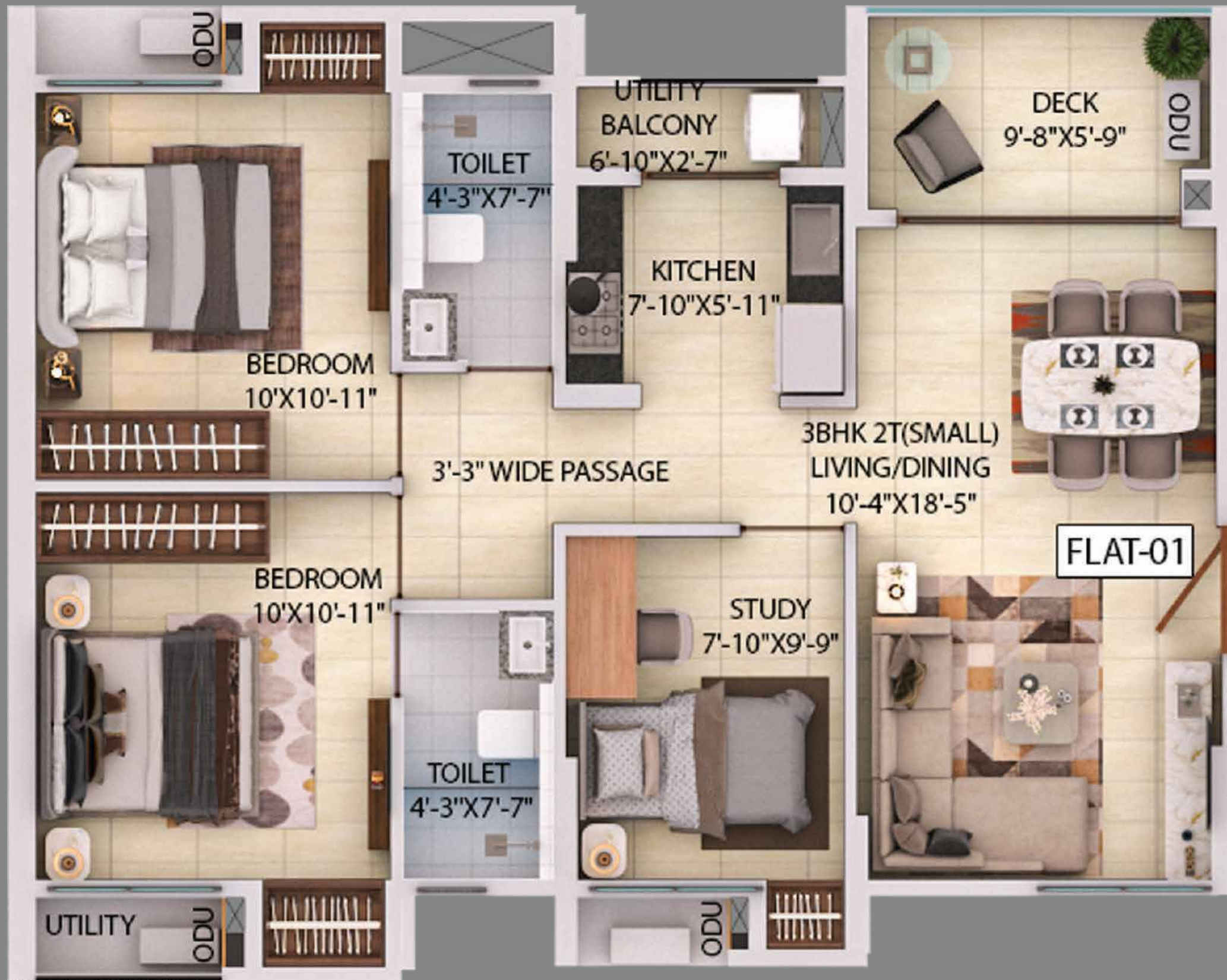
TOWER C - FLAT 1