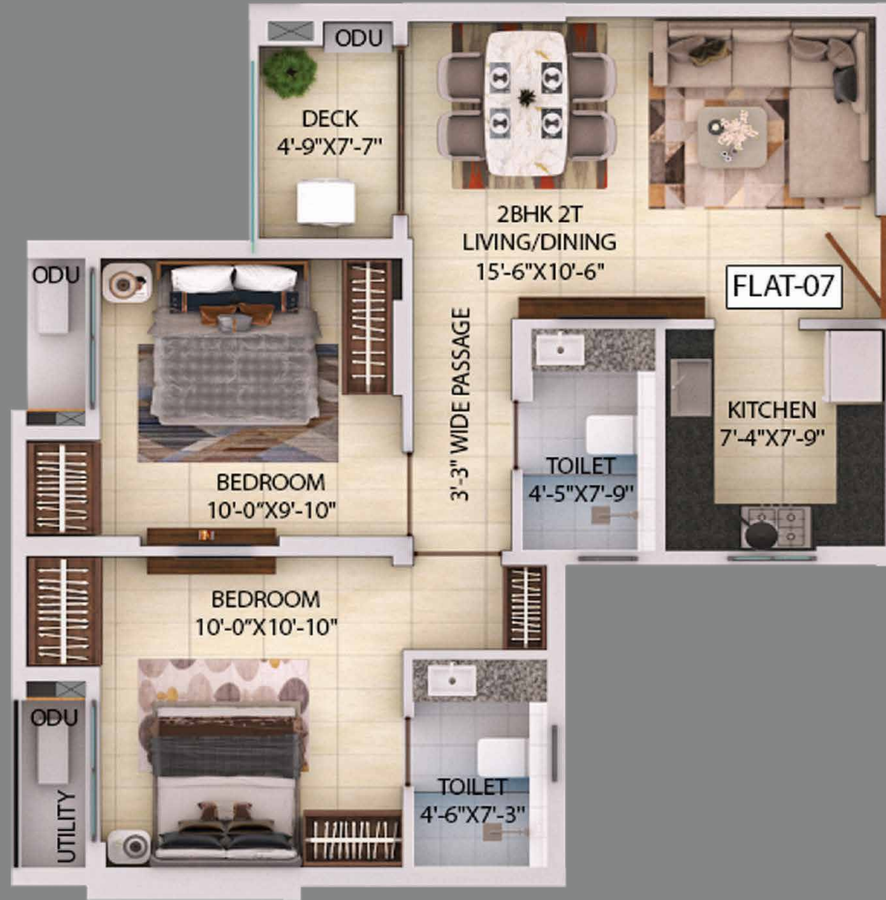
TOWER C - FLAT 7