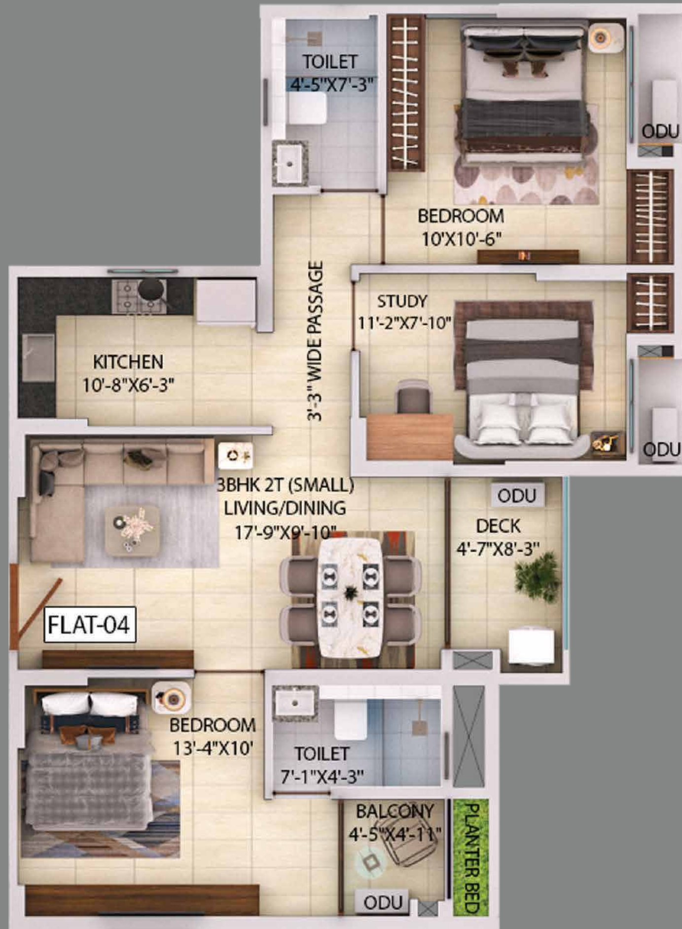
TOWER C - FLAT 4