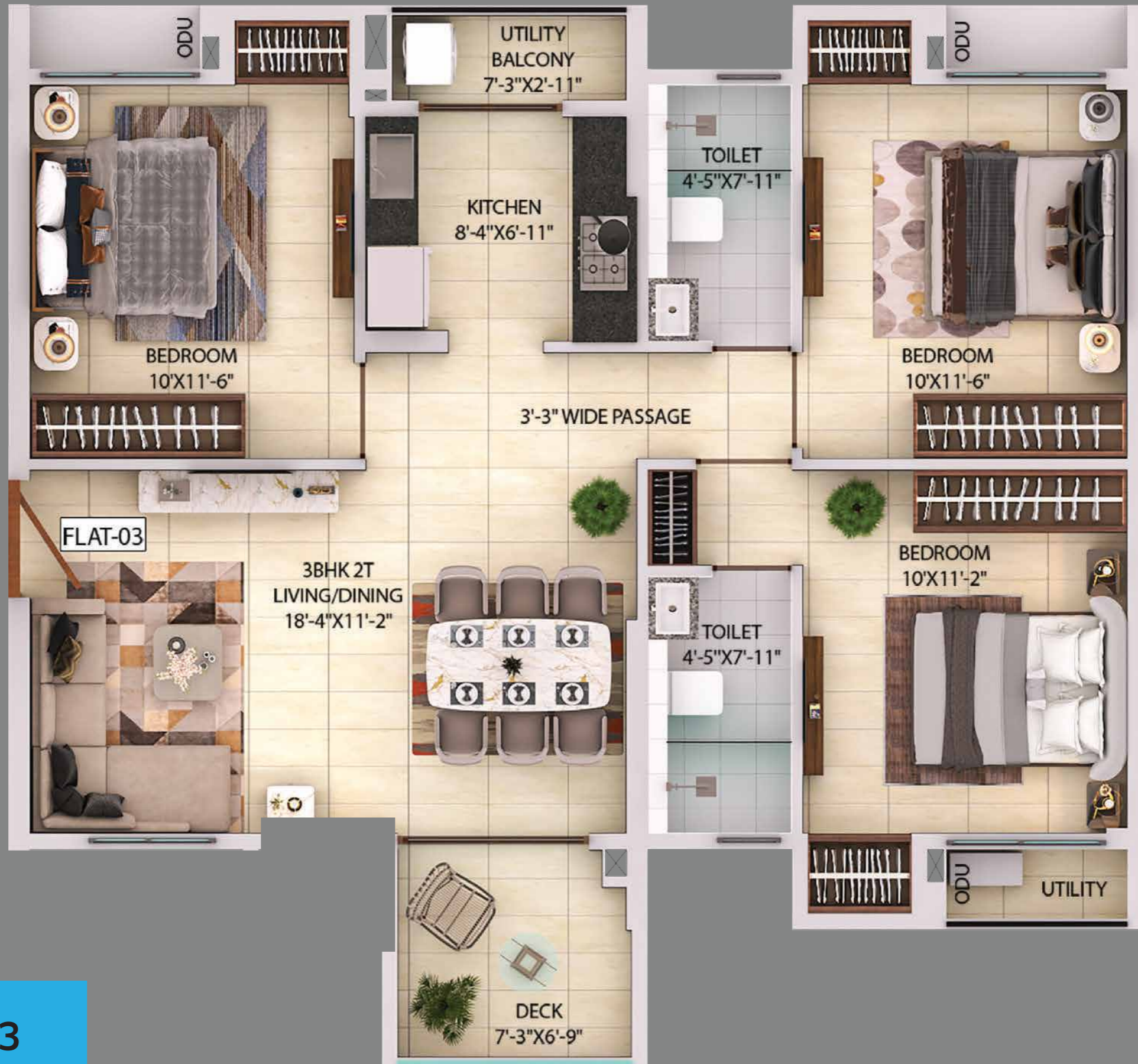
TOWER B - FLAT 3