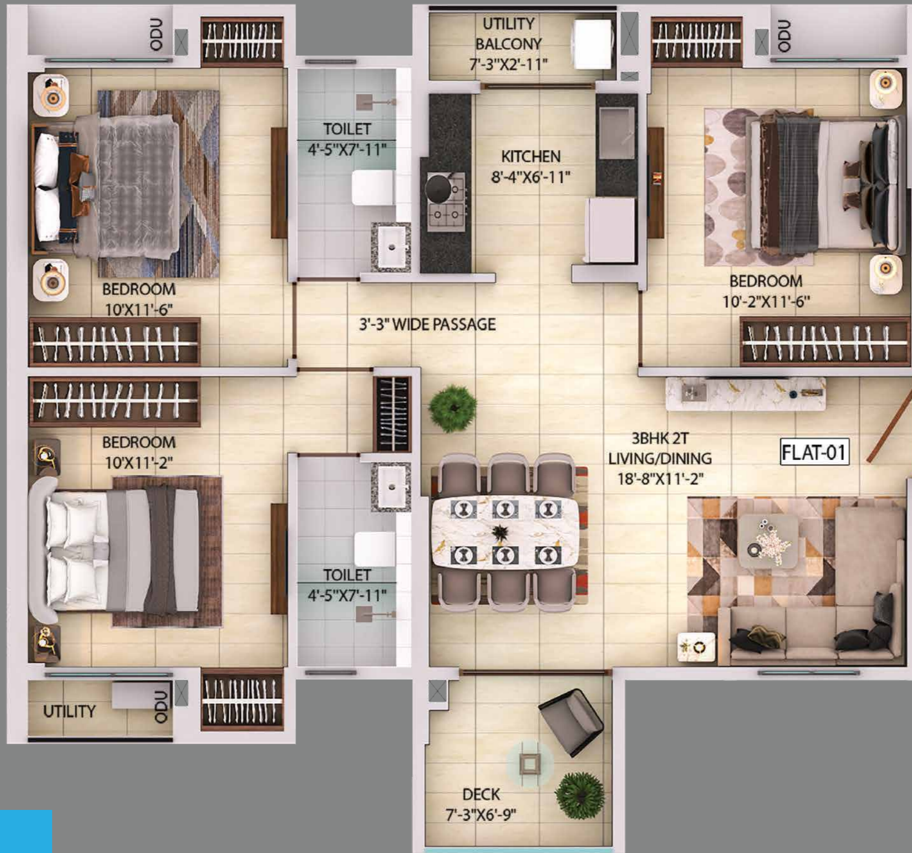
TOWER B - FLAT 1